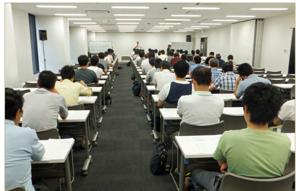
The previous preliminary test venue <Nagoya Venue>

For further information, please contact: