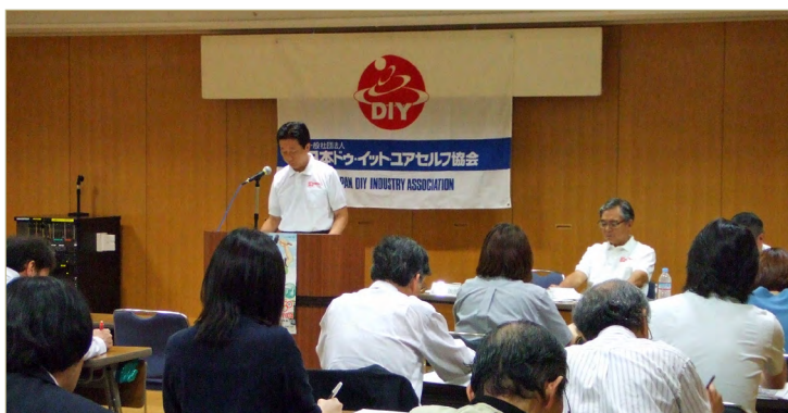
Above: Briefing for the exhibitors Below: Press conference