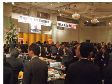
The New Year's special seminar & the New Year's celebration party

For further information, please contact: