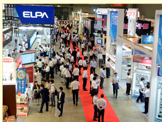
Photo from the previous show

The show theme of the JAPAN DIY HOMECENTER SHOW 2016 is “Let’s DIY: The Joy of Creating, the Joy of Improvement”. In this year’s show, we will advise enjoying DIY with families and friends than just enjoying it alone. We will make efforts to meet people’s expectation by presenting various ideas useful for a living and by arranging innovative events.