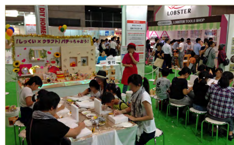
Sparkling! DIY Women

“Buyers’ Booth Tour” is a plan to guide buyers from exhibiting companies including those from home improvement centers who wish to do business, with foreign exhibitors around the overseas exhibit area with interpreters assigned to them.