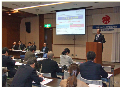
The briefing for the show held in November 2015