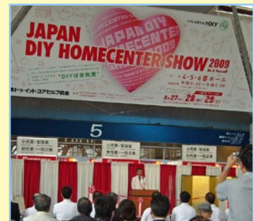
*Photo is JAPAN DIY HOMECENTER SHOW 2009

The show theme for this year is "New to me! Something good for housing. Good living." It is our own power that can turn our daily life into fun and satisfying one. In order to make sure that DIY can support people in changing their living, we will link the show events to the exhibitors' ones in order to present various ideas to the visitors.