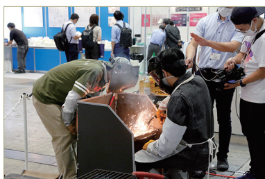
Exhibitor Workshop (Welding)

Buyers and people associated with the business participated in making artworks at the events such as “Men’s Workshop” and “Shining DIY Women” which was previously open to the general public. A participant said, “When I actually run the welding machine, I feel it in my body and it helps me when selling it”.