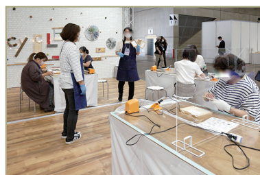
Shining DIY Women